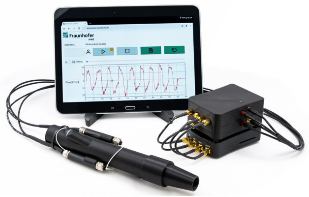
Figure 2: Ultrasound spirometer by Fraunhofer IPMS