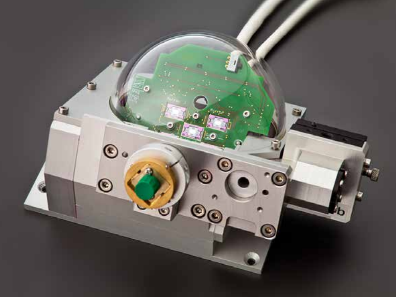
Optical scan head of a 3D-TOF camera with integrated MEMS scanning mirror array.