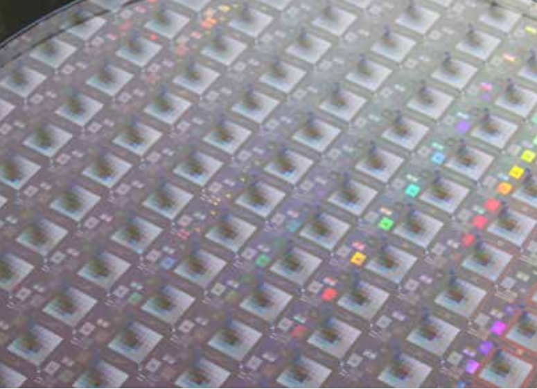
300 mm CMP test wafer with pitch / density structures down to 28 nm node