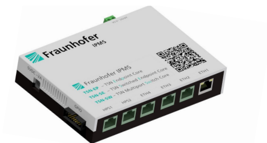
TSN Evaluation Kit: Xilinx ZCU102 or Intel Netleap (Cyclone V SoC); implemented IPMS TSN-IP core for endpoint applications (TSN-EP).