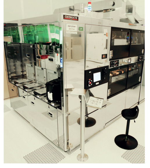
TEL ACT 12 Clean Track for fully automated 12" coating and development