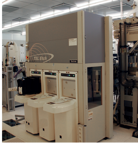
Tokyo Electron Mainframe with VIGUS chamber (specifications see below)

Wafer sizes for metrology tools: 8" & 12"