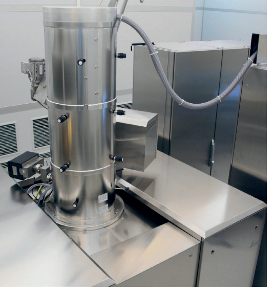
Vistec SB3050DW variable shaped E-beam for direct maskless patterning