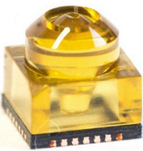
Li-Fi GigaDock® transceiver for short-range, high data rate data transmission with light.