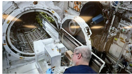
Astronaut on the International Space Station ISS assembling the components.